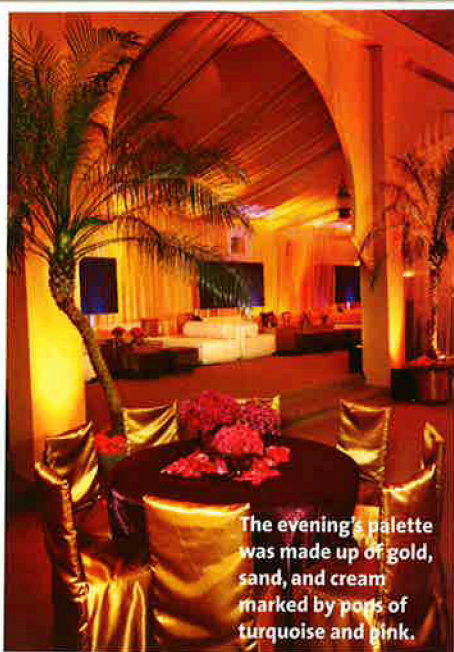
The evening's palette was made up of gold, sand, and cream marked by pops of turquoise and pink.