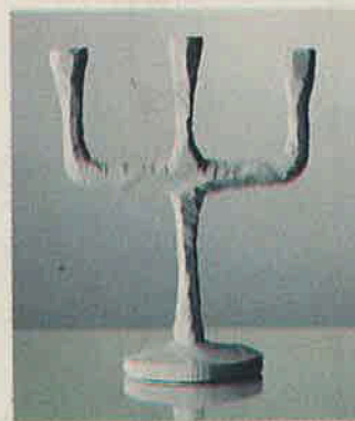
Raw candelabrum by Muuto; $249 at the Future Perfect, (877) 388-7373, thefutureperfect.com.