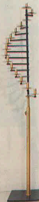
Pair of Danish adjustable candelabra at Coolhouse; $1,200 at coolhouse.com.